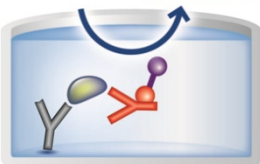
Substrate Colored Product

Add TMB One-Step Development Solution to each well. Incubate at room temperature. Add Stop Solution to each well. Read at 450nm immediately.