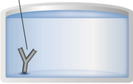
Primary Capture Antibody

Prepare all reagents, samples and standards as instructed.